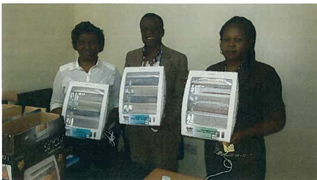
11 heaters donated to Kiambu County, 9 from UNFCU & Harambee4Africa